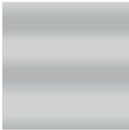
Galvanised Steel Finish